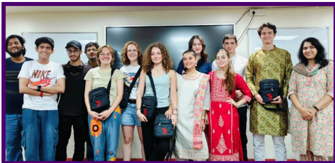
SCIE conducted an Orientation program for Incoming Exchange students from France and the Netherlands.